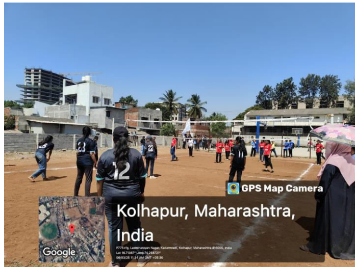
Final match of throwball